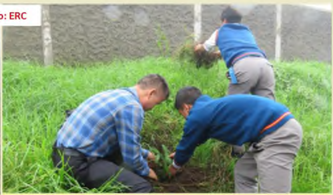
Tree plantation at ERC, BSI, Shillong during Vanmahotasav 2017