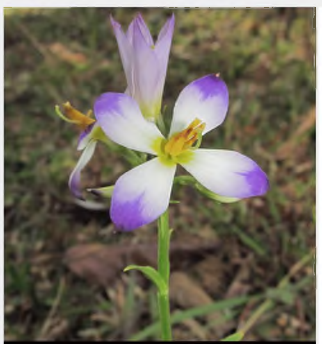
Exacum tetragonum Roxb. (GENTIANACEAE) is a perennial herb with attractive flowers and medicinal properties, commonly known as 'Bicolor Persian violet'. It is distributed from India to Australia through Southeast and East Asia. The plant is cultivated in many gardens for its ornamental value.