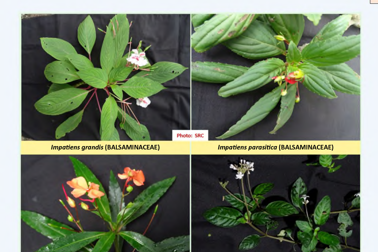
Impatiens verticillata (BALSAMINACEAE)