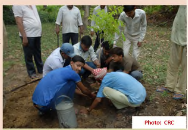
Plantation of Khaya senegalensis during Vanmahotsava by Green Skill Development Programme Trainees

Vanmahotsava was celebrated at CRC, Allahabad from 1st July to 7th July, 2017. All officers, staff and research scholars actively participated in the celebration with great zeal.