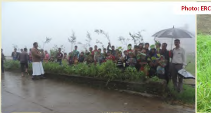
Distribution of tree saplings among students during celebration of Vanmahotasav 2017