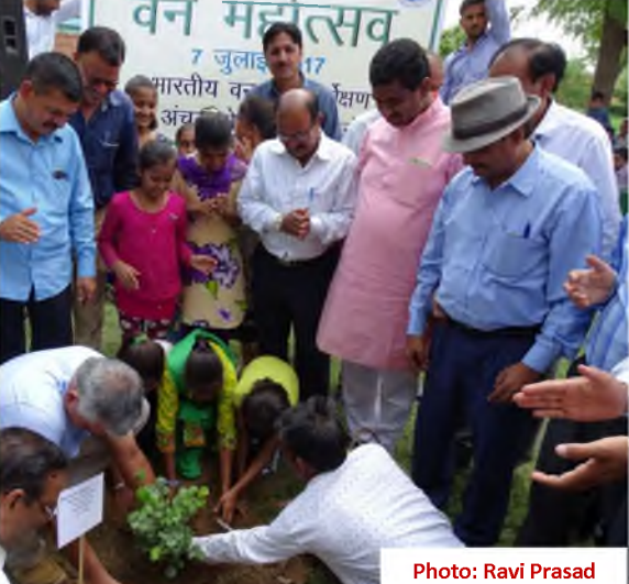
Planting of sapling during Vanmahotsav 2017